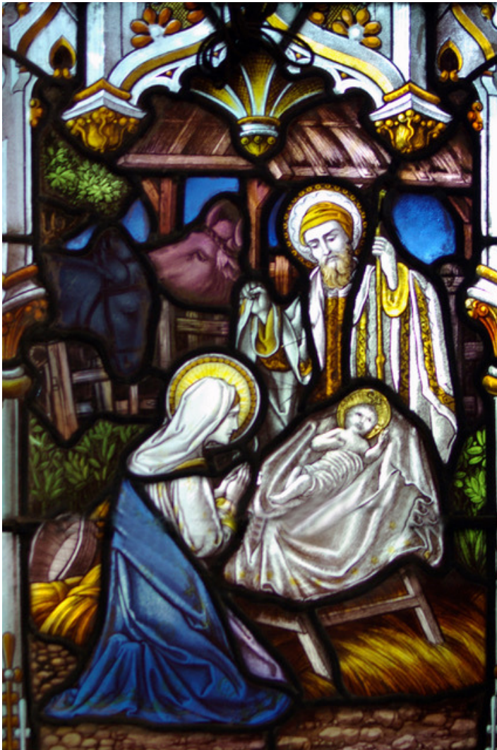
Detail from one of the nave windows at St Mary's Brownedge.

Live Streaming via website ( churchservices.tv )